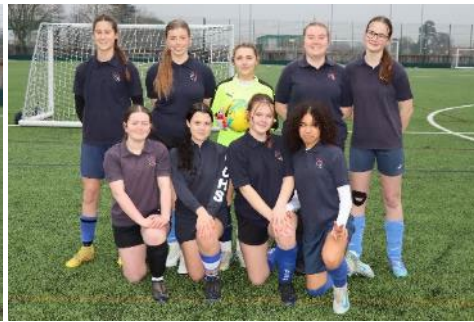
Pictured above our Year 7, Under 14 and Under 16 Girls Football Teams

Our Year 7 girls have had a great first season as our newest squads and have started to gel well as a team. After a defeat against Tendring in their first game, the girls were on cloud nine with a decisive 3-0 victory against Colne last week. They completed their short season this week with a 2-0 victory against Manningtree High School; they have worked amazingly as a team across their three games and played some fantastic football – Well done girls!