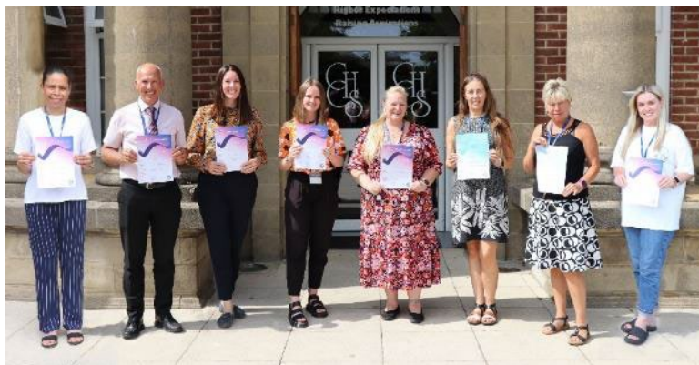
CCHS staff with their awards

We are exceedingly proud to announce that staff at Clacton County High School staff have been awarded a record nine awards in the Pearson Teaching Awards 2023. These annual awards are nationally recognised and celebrate all those who work within the educational profession who are role-models and an inspiration to the young people they teach and help. The CCHS winners were nominated by their colleagues and found out in a special celebration staff meeting as part of last week's national 'Thank a Teacher Day'.